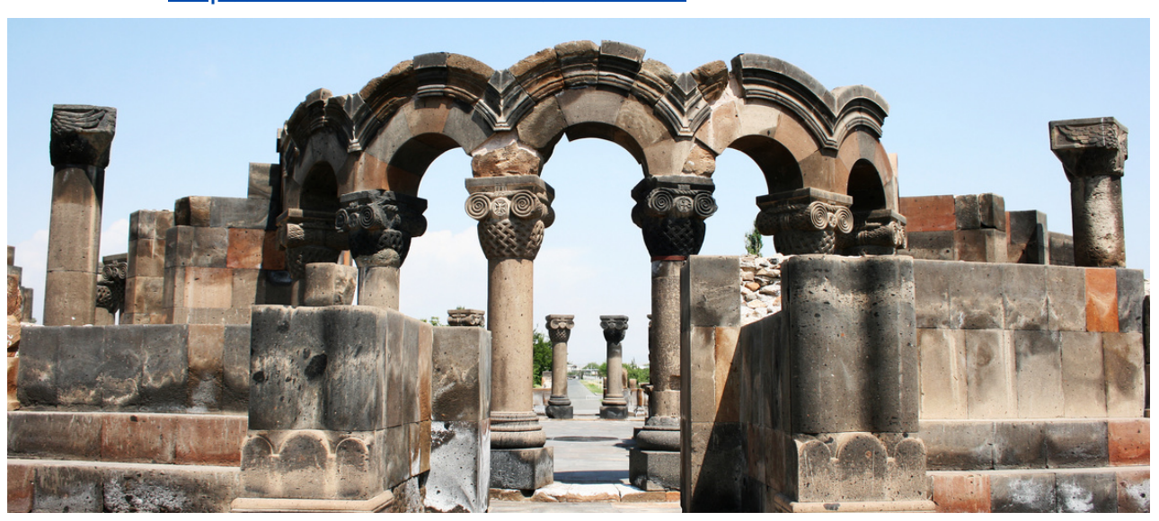
Zvartnots Cathedral (7th c.)

Information: <a href="http://www.zvartnots.aero/EN/index">http://www.zvartnots.aero/EN/index</a>